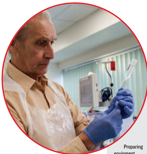
Preparing equipment for dialysis

2 York Teaching Hospital NHS Foundation Trust