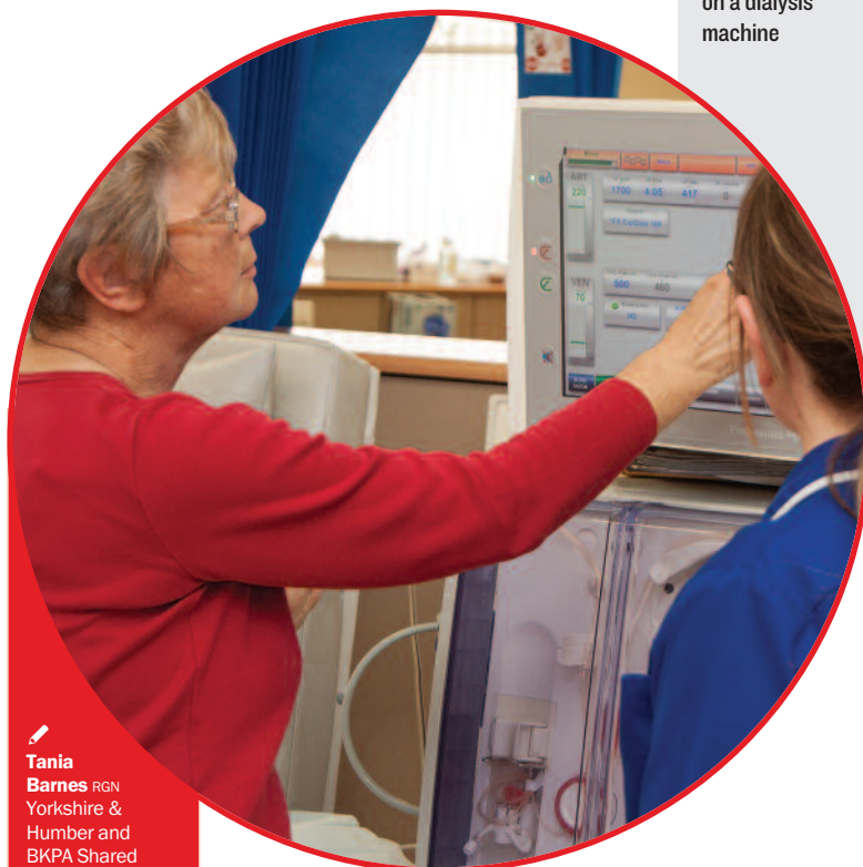
Programming a prescription on a dialysis machine

Being told that you have kidney disease, a serious long-term condition that requires dialysis, can feel overwhelming. It is easy to feel that you have lost control over your life, par-